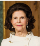
STOCKHOLM EARLY MUSIC FESTIVAL STÅR UNDER H.M. DROTTNING SILVIAS PERMANENTA BESKYDD.